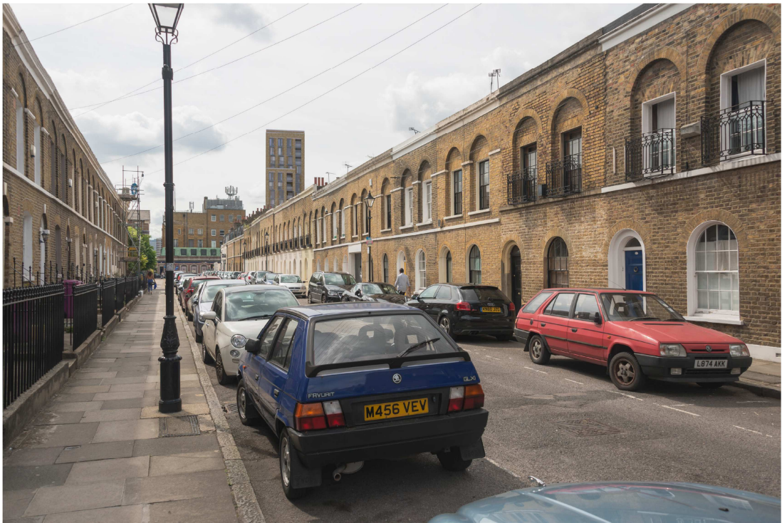
Figure 3 – CGI View South on Aberavon Road

roofline of a group of Grade II listed buildings on its western side, shown in the photograph below.