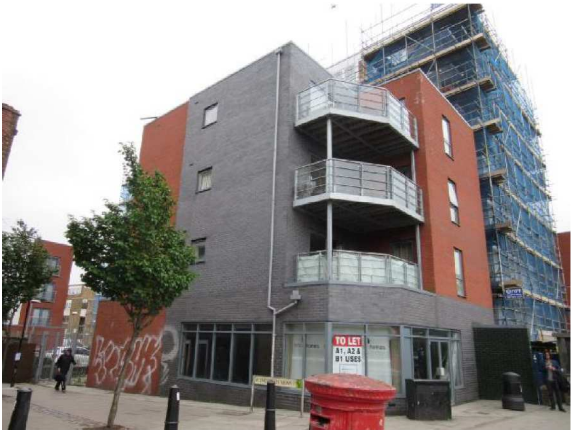
Figure 7 - Beckett Court