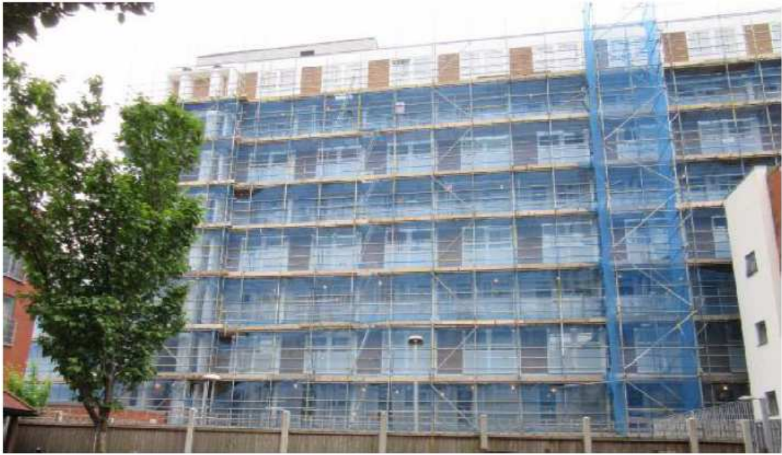
Figure 8 - 1-36 Wentworth Mews