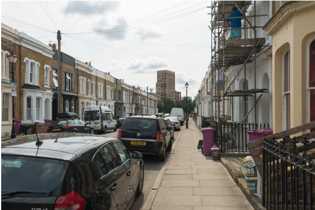
Figure 4 - CGI View South on Clinton Road

8.115 Similarly the Ropery Street conservation area is characterised by the horizontal lines of the wide road and low-rise buildings. The proposal would disrupt this horizontal uniformity when looking north from the conservation area again causing some harm to the townscape.