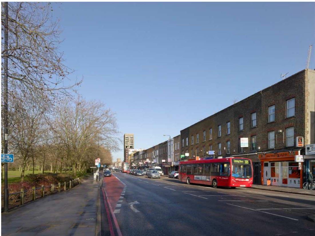
Figure 5 - CGI View North on Burdett Road

8.115 Similarly the Ropery Street conservation area is characterised by the horizontal lines of the wide road and low-rise buildings. The proposal would disrupt this horizontal uniformity when looking north from the conservation area again causing some harm to the townscape.