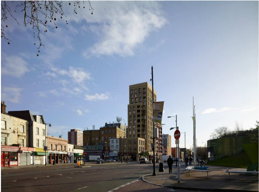
Figure 6 - CGI View West on Mile End Road

8.118 The stepped massing allows the building to relate to the different surrounding scales in the immediate context and the central tower also sets its own prominent scale as a landmark building. It is considered that the traditional materiality of brick and stone will relate well to the buildings of the surrounding area. The excellent architectural quality and finish of the proposal would allow the building to be a landmark for Mile End town centre that would be commensurate with the size of the junction and takes advantage of the site's transport accessibility. It is considered that the building will aid in creating a sense of place that signifies the regeneration of the town centre and may stimulate further investment. In addition to this it will aid in the legibility of the city, marking the town centre and Mile End underground and as such helping way-finding. However, the harm to certain sensitive views from conservation areas and to the setting of listed buildings has also been considered and is, on balance, acceptable given the public benefits of the scheme including provision of much needed housing, provision of upgraded commercial space in a town centre location and the potential wider regenerative benefits of the scheme.