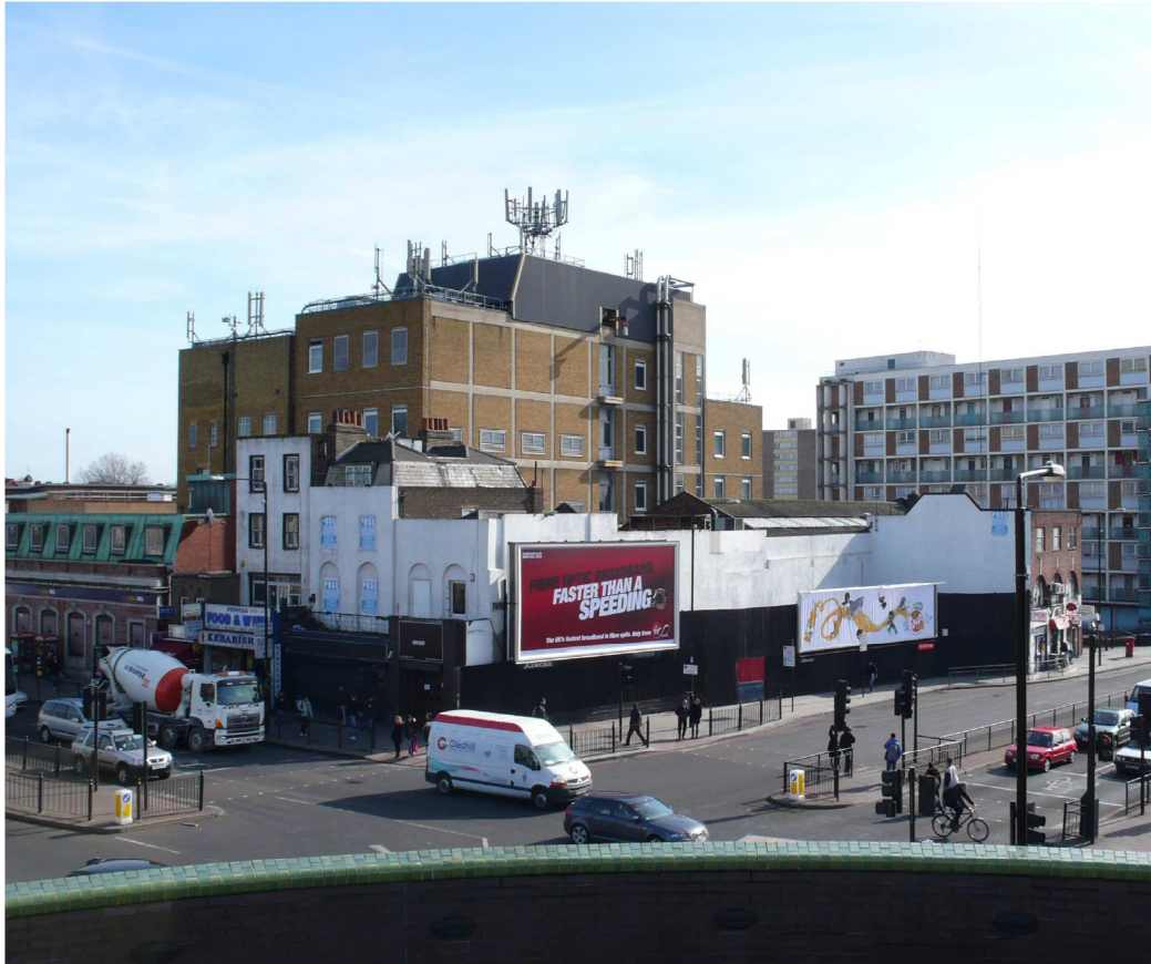
Figure 1 - Existing Site